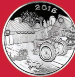
C. Farm Scene