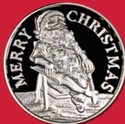
F. Beach Santa