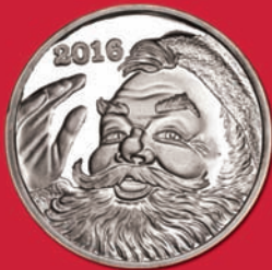
A. Santa Face

This year we've picked the best made and best designed one troy ounce .999 Fine Silver rounds for our customers. Get into the holiday spirit with these individually sealed and adorable collectibles. Order early, we sell out quickly. PRICES SUBJECT TO MARKET