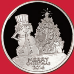
B. Patriotic Snowman