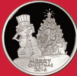
B. Patriotic Snowman