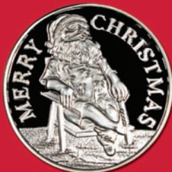
F. Beach Santa