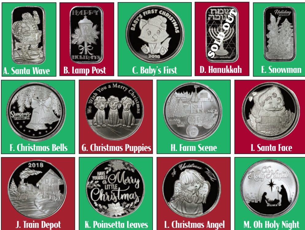
A. Santa Wave