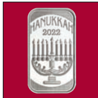
I. Happy Hanukkah