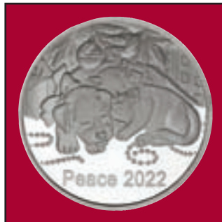
D. Peace w/Dogs