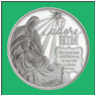
C. Holy Family