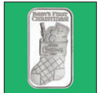
J. Baby's 1st Xmas

Coin Reverse Poinsettia Leaf, Dated 2022 PRICES SUBJECT TO MARKET