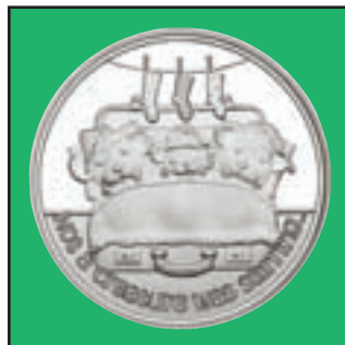
H. Mice w/Stockings