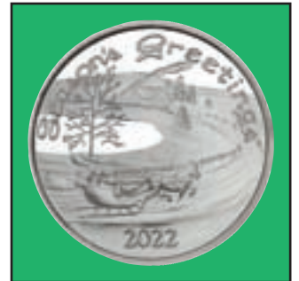
B. Winter Scene