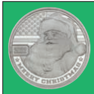
E. Patriotic Santa