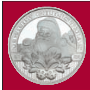
A. Santa with Bells

Make the season extra bright with these beautiful reflective holiday rounds. Each of these treasured keepsakes are one troy ounce struck in .999 fine silver. All are dated 2022 on the reverse. Continue (or begin) the holiday tradition of giving and receiving these holiday commemoratives. PRICES SUBJECT TO MARKET