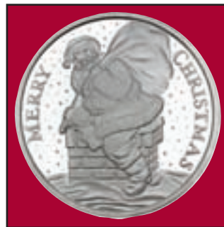
A. Santa Chimney