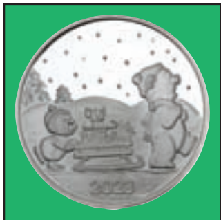
C. Penguin & Bear