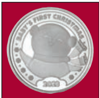
G. Baby's First