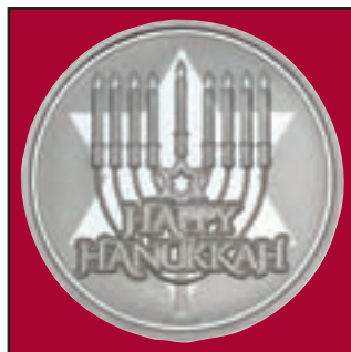
I. Happy Hanukkah