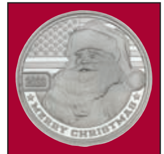
F. Patriotic Santa