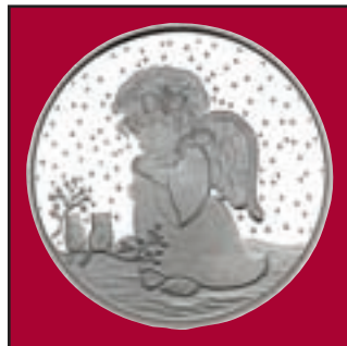
D. Praying Angel