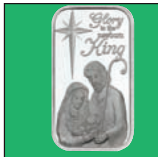
H. Holy Family