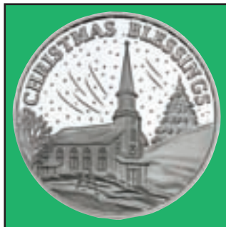
E. Church Scene