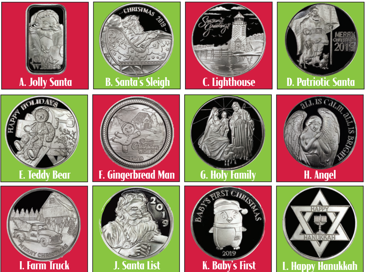
A. Jolly Santa

Get into the holiday spirit with the best made and best designed 2019 one troy ounce .999 fine silver ingots. The reverse features the inscription "Best Wishes For Peace and Joy This Holiday Season" and come individually sealed in plastic. All are dated 2019.