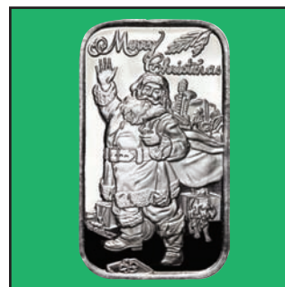
J. Waving Santa