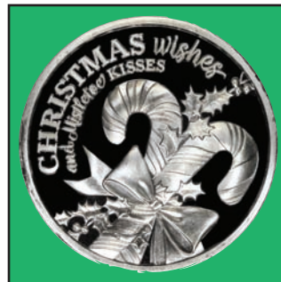
B. Candy Canes