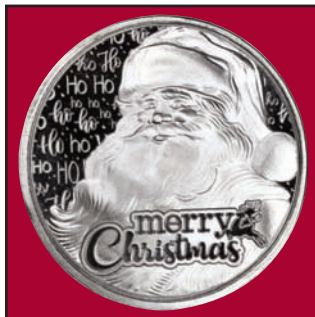
A. Santa "Ho Ho"

A special Christmas Tradition, giving and receiving these beautiful keepsake coins. These custom minted holiday coins are each one troy ounce of .999 fine silver and come individually sealed in plastic. All are dated 2020.