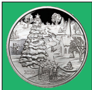
C. Winter Scene