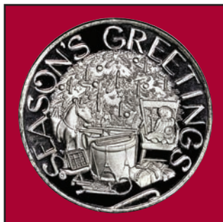
D. Toys Under Tree