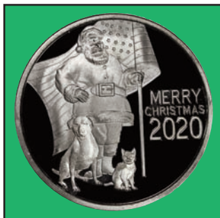
E. Patriotic Santa