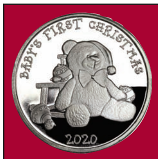
I. Baby's First